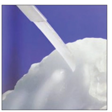
Deepchill<sup>™</sup> cooling fluid is 100% recyclable and environmentally friendly.

Sunwell Technologies Inc., which is the global leader in variable state slurry ice (Deepchill<sup>TM</sup>) production, storage and distribution, has developed refrigerated units that solely rely on Deepchill<sup>TM</sup> thermo batteries. The size of a refrigerated unit can vary between a small box and the size of a truck trailer. The Deep-