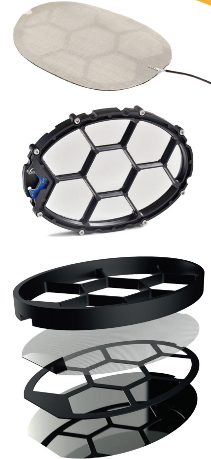
FIGURE 1. Top to bottom: WAT's HPEL transducers; single laminate, assembled, and exploded views of a finished HPEL transducer. All laminates are made in the UK.

HPEL transducer design they enlisted the help of Xi Engineering, a COMSOL Certified Consultant that specializes in computational modeling, design recommendations, and solving noise and vibration problems in machinery and other technology.